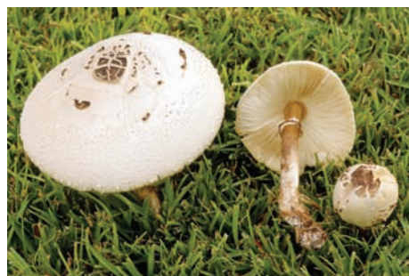
Chlorophyllum molybdites