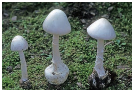
Amanita virosa