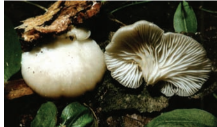
Top: Pleurocybella porrigens , or Angel's Wings, growing at Devil's Lake Park, Wisconsin.