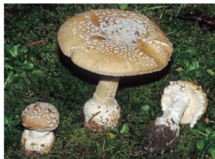
Amanita pantherina .