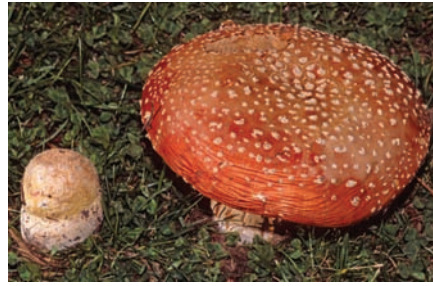
Amanita muscaria var. muscaria .