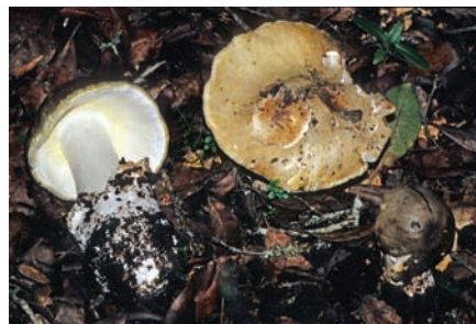
Amanita phalloides .