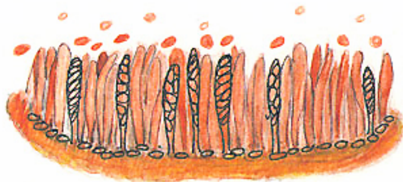
MICROSCOPIC VIEW OF SPORES IN SACS